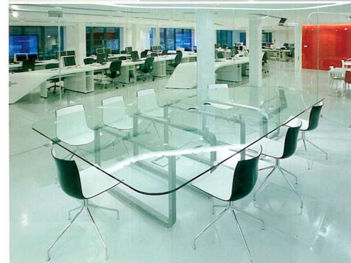
Architect: Andrew Wallace Architects Client: Code Computer Love Title: Code Computer Love Award: Chairman's, Best Interior, Sponsored by Design Initiative